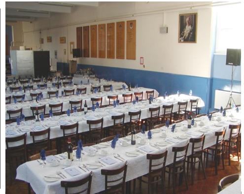
OJA Annual dinner 2003 (SJC Refectory)

The Royal sailors' home club, Queen's Road. Received our first visit on Saturday 13 th May 2006. We returned here the following 2 years to 2008.