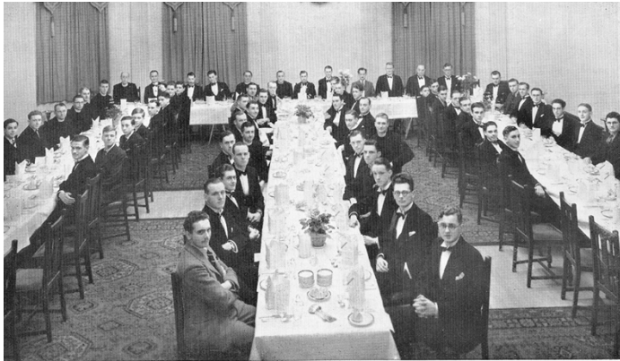
THE OLD JOHANNIAN DINNER—1933.

Of course, we will continue to investigate other options and seek the best solution for continuing the OJA traditions.