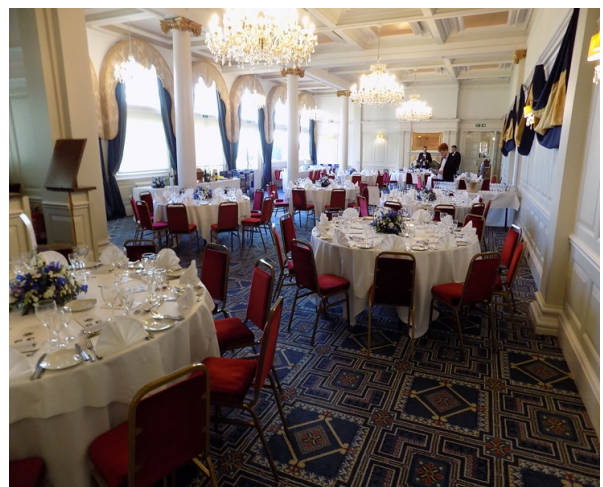
OJA Annual dinner 2019 Queen's hotel

We have been served well by the Queen's hotel. Our first visit was in 2009 for the college centenary dinner. We also enjoyed a very successful OJA centenary dinner there in 2019 and again the dinner last year. It is located in Southsea, overlooking the Solent and Southsea common. Its location is logical for us. We are currently in talks with the hotel to explore possible longer-term arrangements whereby we would enjoy more advantageous rates for the dinner venue and guest accommodation along with a venue for our committee meetings.