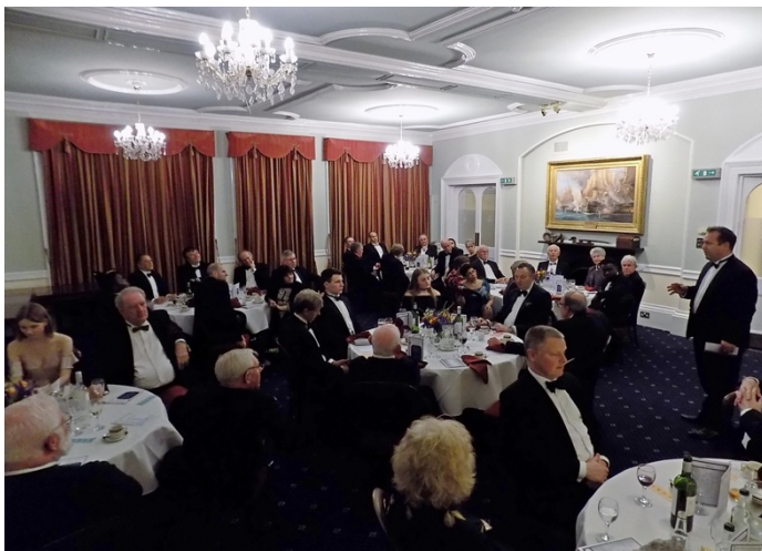
OJA Annual dinner 2017 RN & RAYC club

The Royal sailors' home club, Queen's Road. Received our first visit on Saturday 13 th May 2006. We returned here the following 2 years to 2008.