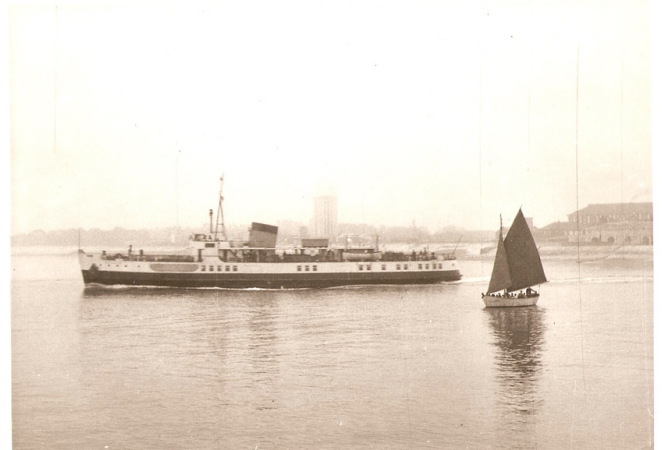
SPICE ISLANDER The SJC boat used for pupils during the earlier days of the college.